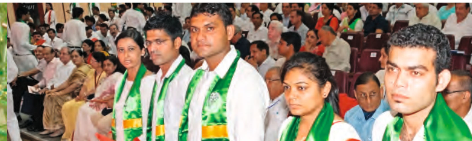
Students receiving degree at the convocation