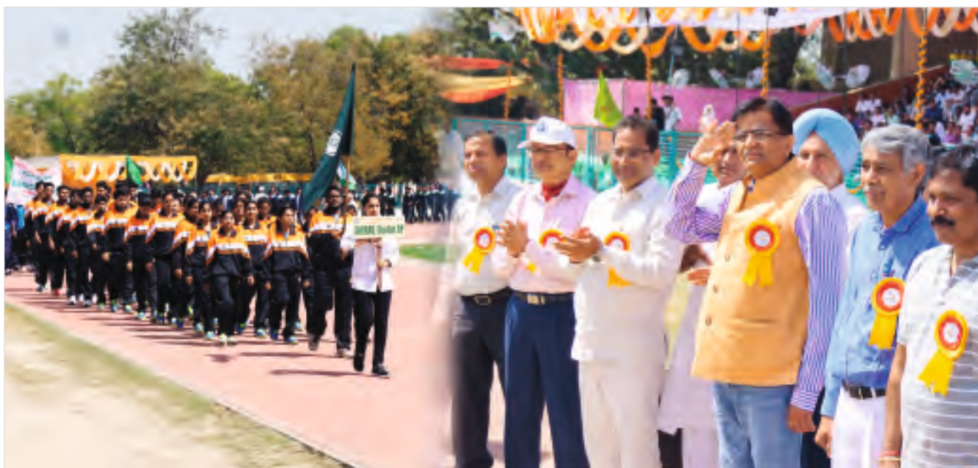
17 th All India Inter-Agricultural Universities Sports Games and Meet 2016-17