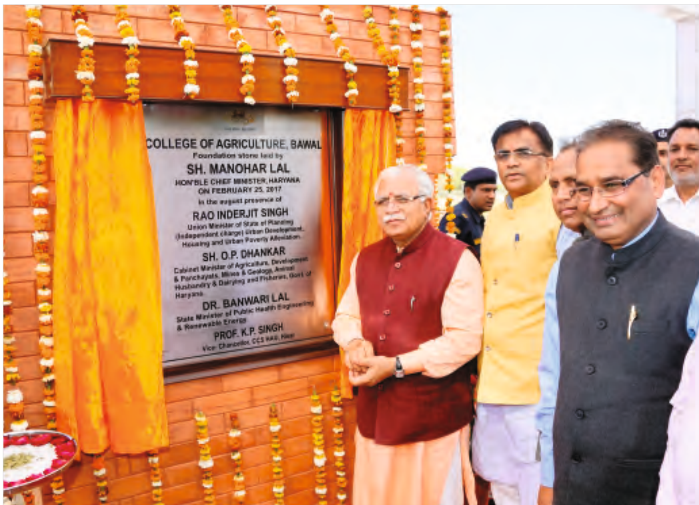
Foundation Stone Laying Ceremony of College of Agriculture at Bawal