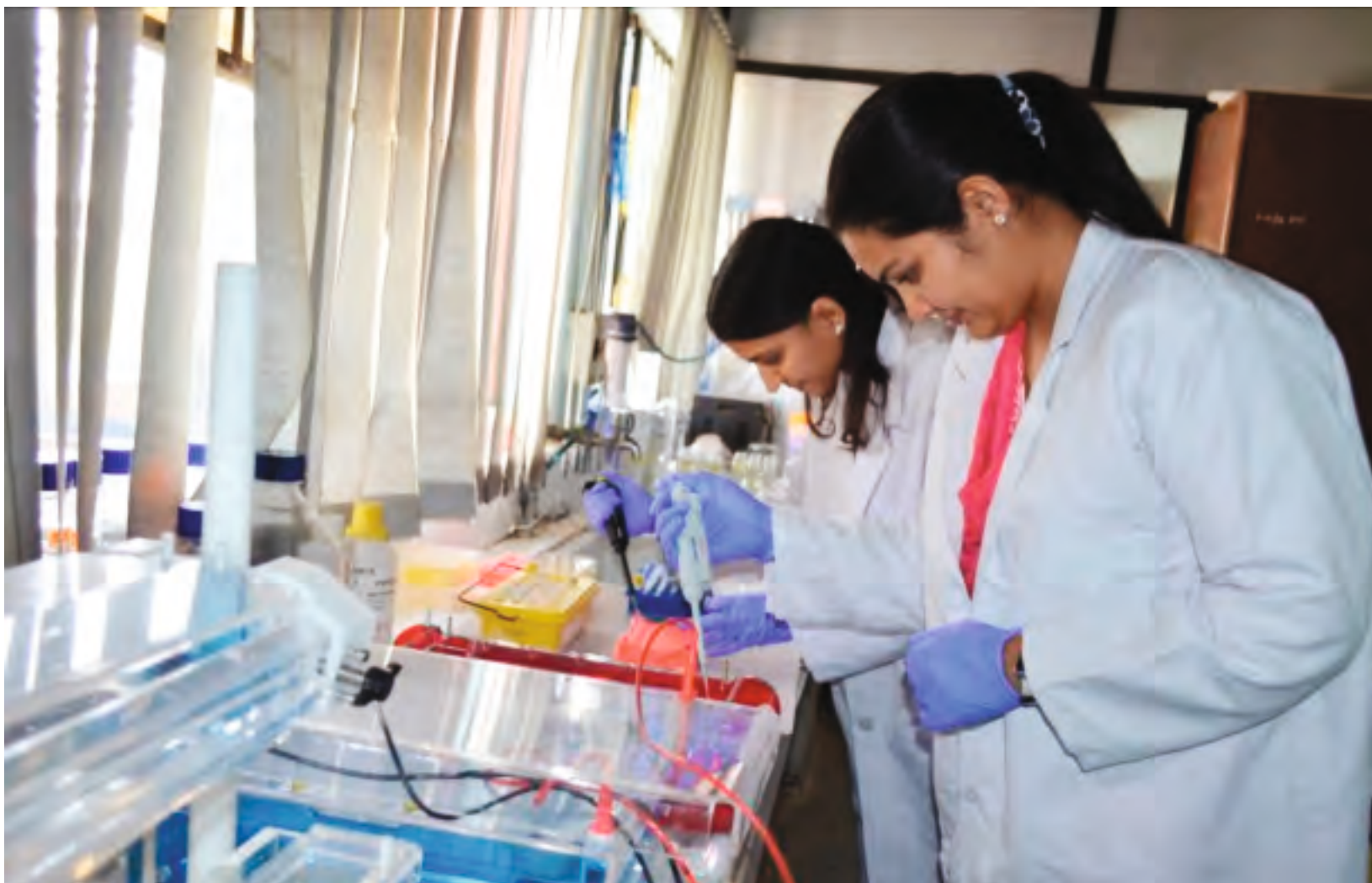
Excellent Laboratory Facilities at CCS HAU