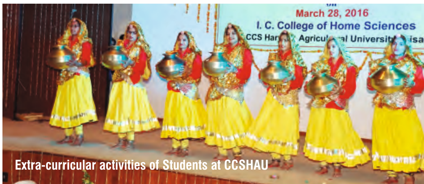
Extra-curricular activities of Students at CCSHAU

The minimum qualifications for admissions of fresh as well as in-service candidates shall be 60% marks (where OGPA is not given) or a grade point average of 6.5 (10.00 basis) at Master's level in the subject concerned (special requirement of subjects for admission to Colleges of Agriculture, Agril. Engg. & Technology, Home Science and Basic Sciences disciplines is given below) from a recognized University. The marks obtained of the project report will not be included in the aggregate marks at the time of preparation of merit. No weightage as specified in rule 13 will be given.