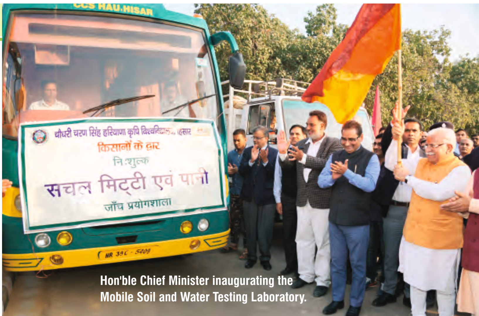
Hon'ble Chief Minister inaugurating the Mobile Soil and Water Testing Laboratory.