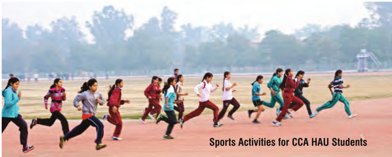
Sports Activities for CCA HAU Students

Tehsildar/Naib Tehsildar Signature with seal