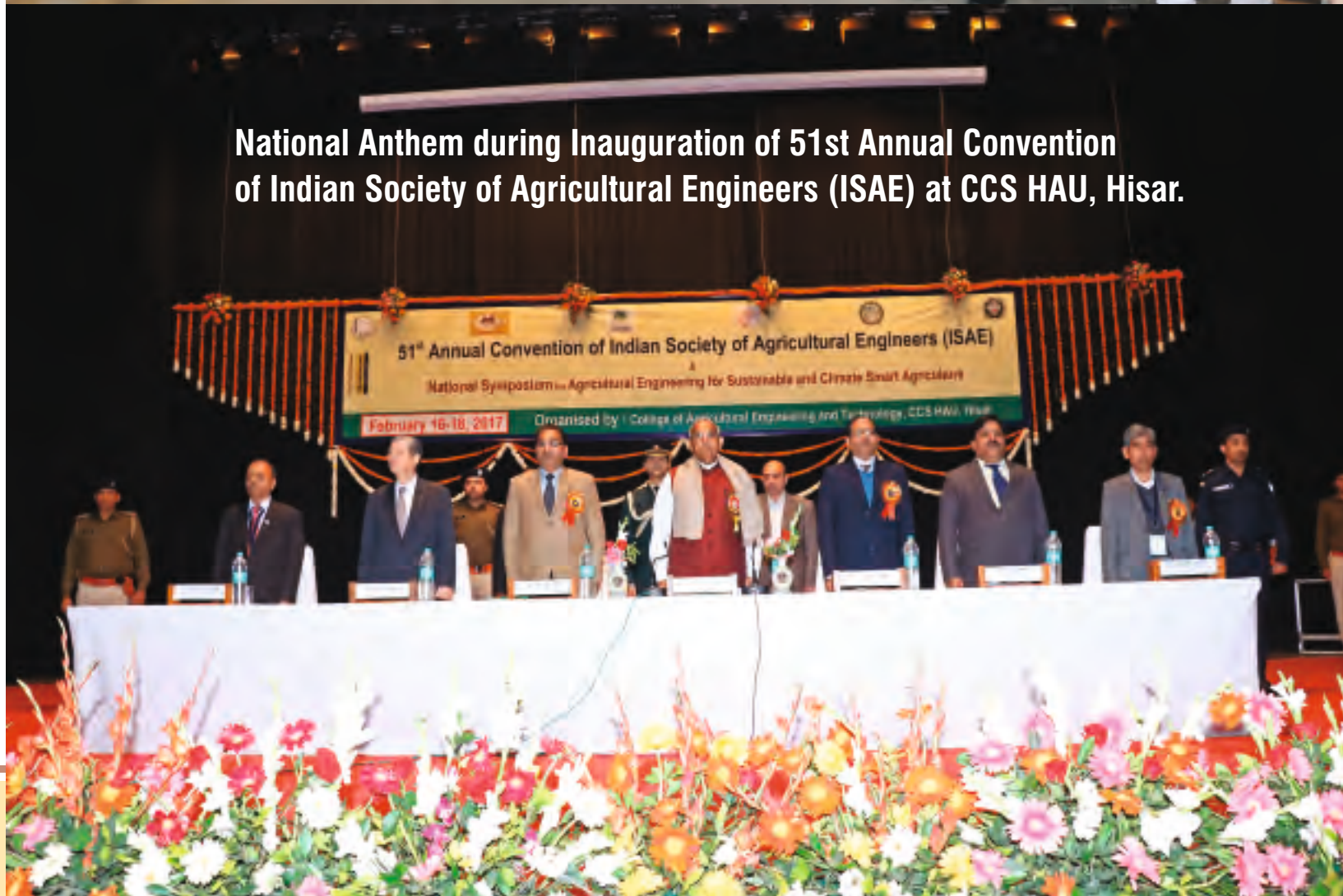
National Anthem during Inauguration of 51st Annual Convention of Indian Society of Agricultural Engineers (ISAE) at CCS HAU, Hisar.