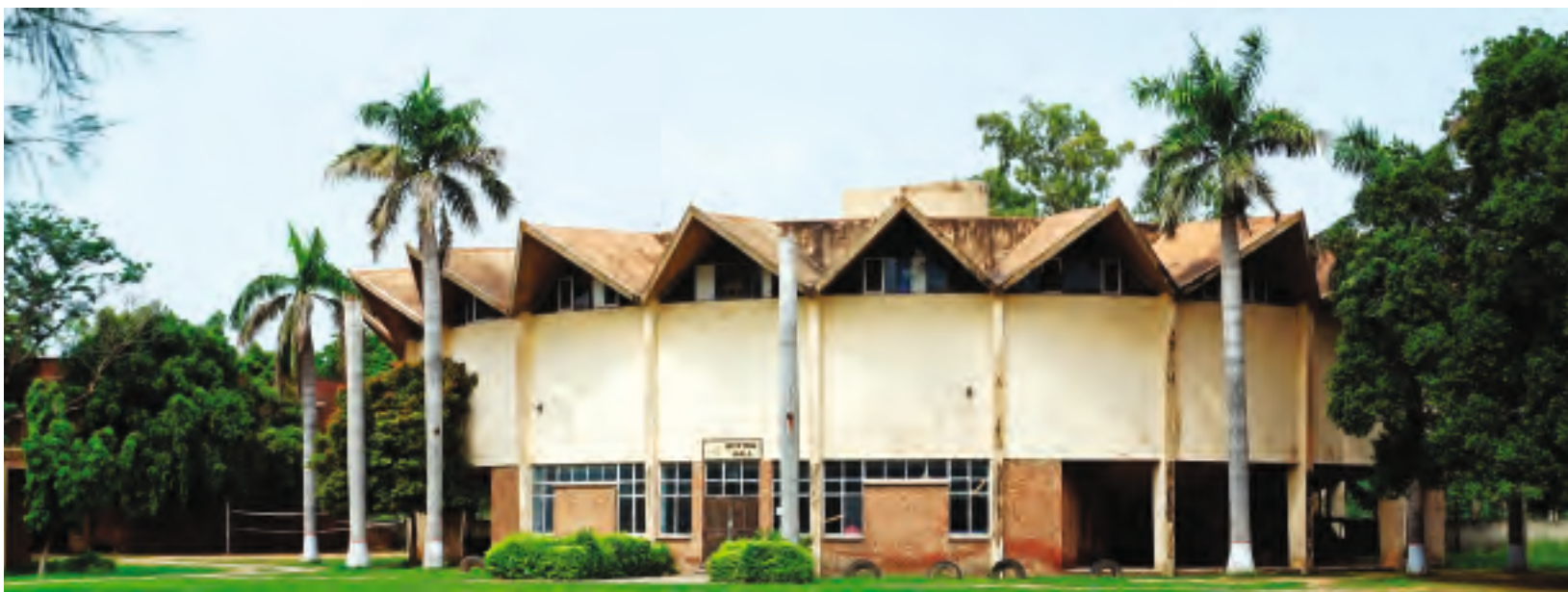
Indoor Boxing Ring at the Giri Centre of CCSHAU

Nuclear Physics : Constituents of nucleus and their intrinsic properties; Properties of nuclear forces; Liquid drop model; Nuclear shell model; Radioactivity, Modes of decay, Alpha, electron, positron and gamma ray emission; Nuclear reactions; Conservation laws; Q value and its significance. Energy loss due to ionization, Bremsstrahlung radiations, Interaction of gamma rays with matter; Cyclotron, Betatron, Linear accelerator, Ionization chamber; Proportional counter, GM counter, Scintillation counter, Elementary particles-classification; Conservations laws; Quarks.