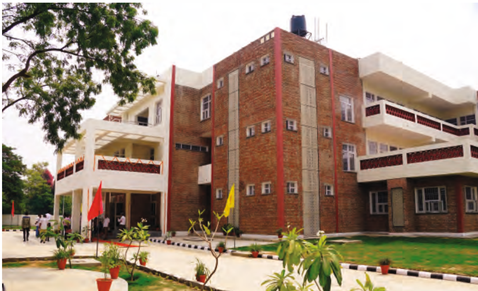
International Girls Hostel at CCSHAU, Hisar

The Prospectus gives only general information about the PGDC programmes offered by various constituent colleges with the major departments offering the programmes. Detailed rules on all aspects are available in the University Calendars and instructions issued from time to time.