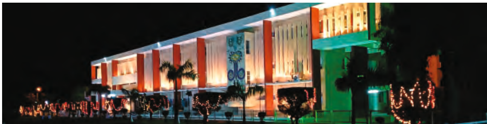
Fletcher Bhawan on the Eve of Convocation-The main Administrative Block of CCSHAU

The candidates who have secured admission during first counselling but failed to get themselves registered on the date prescribed for registration for 1 st Counselling, their seats will be declared as vacant. These vacant seats will be filled up during 2 nd counselling.