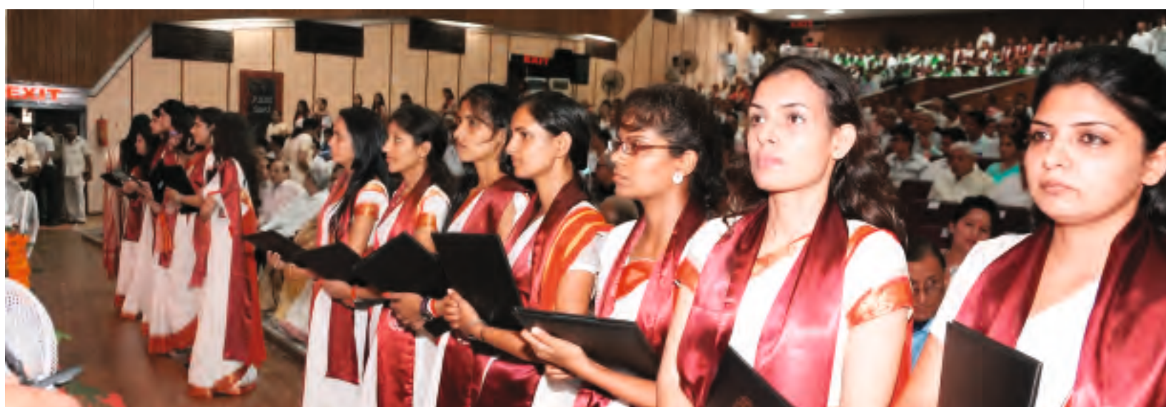
Students receiving their degrees in the convocation

* No seat has accumulated for Ex-Servicemen/Freedom Fighter and their dependents as per roster maintained under 3% horizontal reservation.