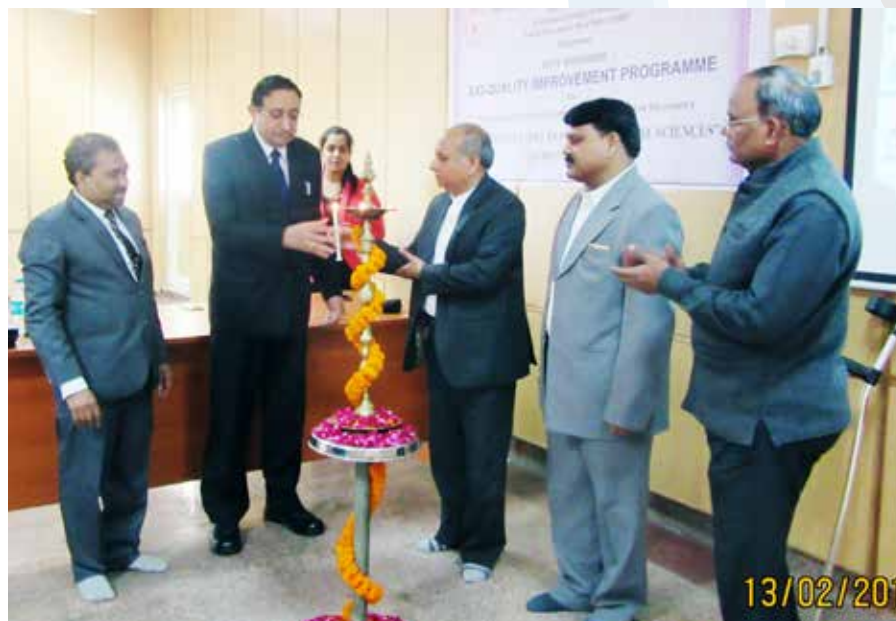
XXII Quality Improvement Program on "Current Scenario in Pharmaceutical Sciences" held during 13 th February - 17 th February, 2017.