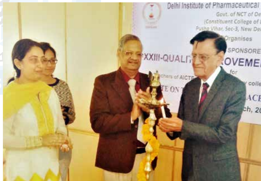
XXIII Quality Improvement Program on "Update on Trends in Pharmaceutical Sciences" held during 27 th February - 10 th March, 2017.