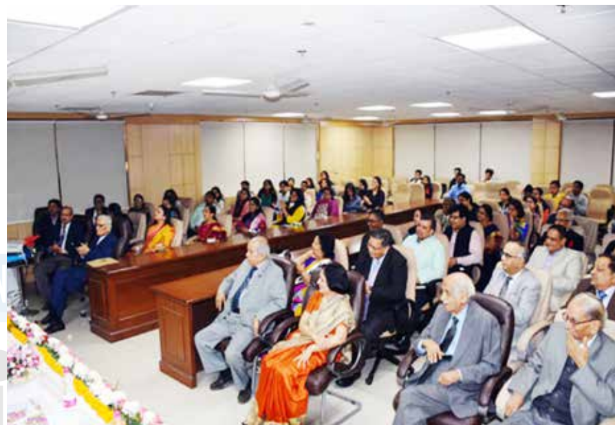
Delegates at Book release cum Brainstorming Session on Contributors of Pharmacologists for vision of Pharmaceutical Education organized on 18 th Nov., 2016