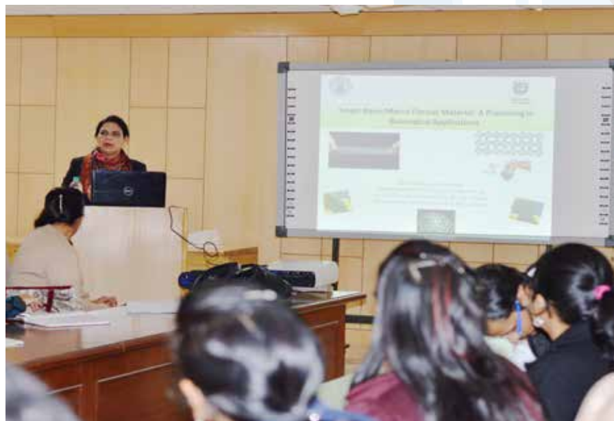
Workshop on the Innovation in Tailored Smart Nano/Macro Fibrous Materials organized on 7 th February 2017.