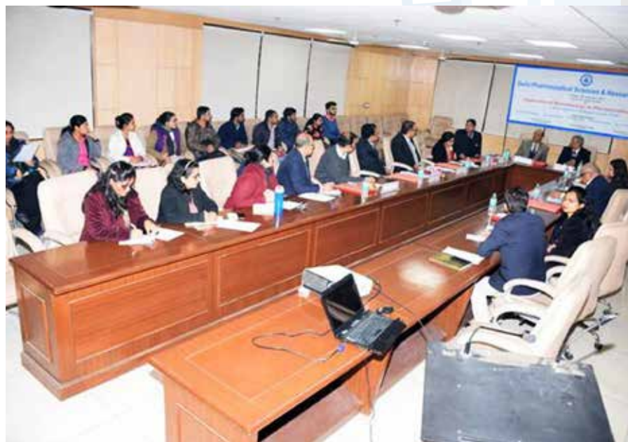
Brain storming session for development of Industry ready programs to cater the needs of upcoming need of Pharmaceutical Industry organized on 20 th January, 2017.