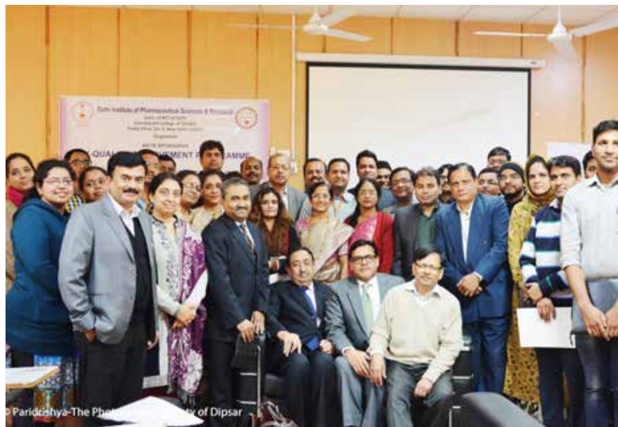
XX Quality Improvement Program on "Recent Advances in Pharmaceutical Sciences" held during 5 th December - 9 th December, 2016.