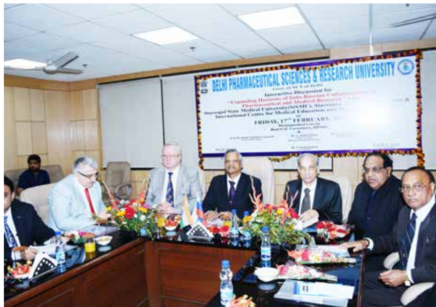
Indo-Russian Collaborations in Pharmaceutical and Medical Research" with Stavropol State Medical University, organized on 17 th February, 2017.