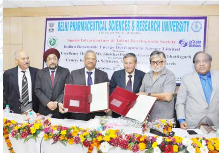
Memorandum of Understanding with Sports Infrastructure & Talent Development Society and Indian Renewable Energy Development Agency signed on 2 nd March, 2017