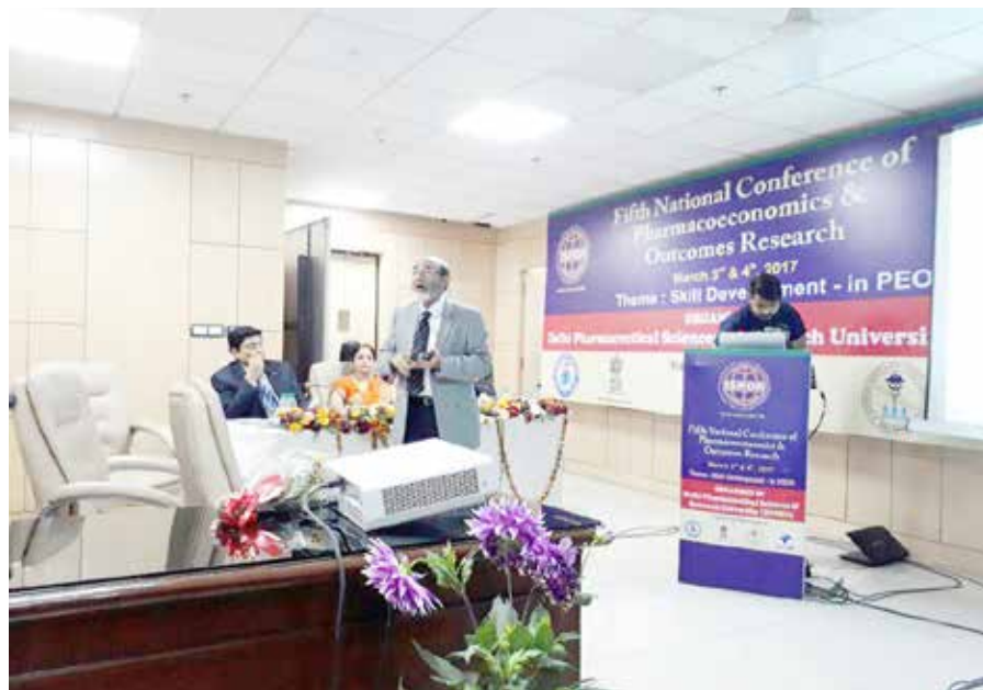
Fifth National Conference of Pharmacoeconomics and Outcomes Research with ISPOR- India chapter organized on 3 rd - 4 th March, 2017.