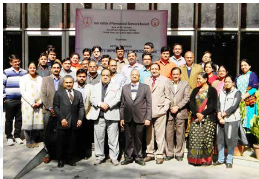
XXI Quality Improvement Program on "Trends in Pharmaceutical Sciences" held during 30 th January - 10 th February, 2017.