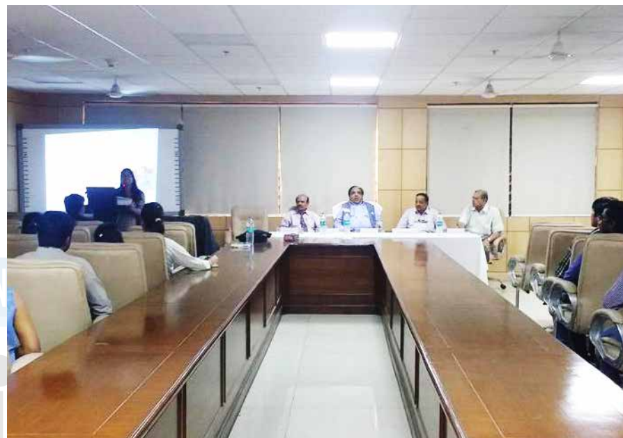
Guest lectures on topic "Fundamentals in research process and cornerstone of a research project and the never ending story of Angiotensin II" on 19 th October, 2016.