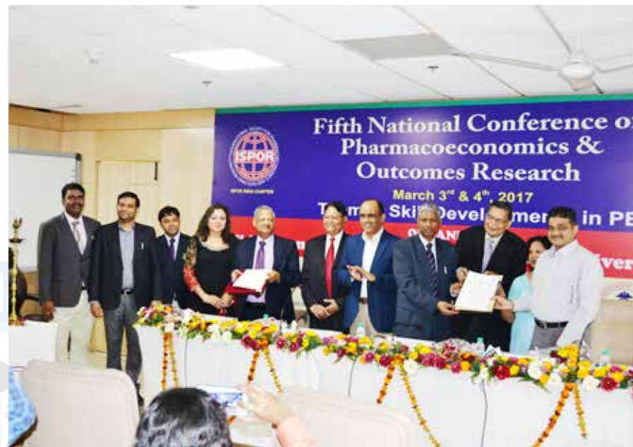
Memorandum of Understanding with Indian Pharmacopoeia Commission, Ghaziabad for collaborative research signed on 3 rd March, 2017