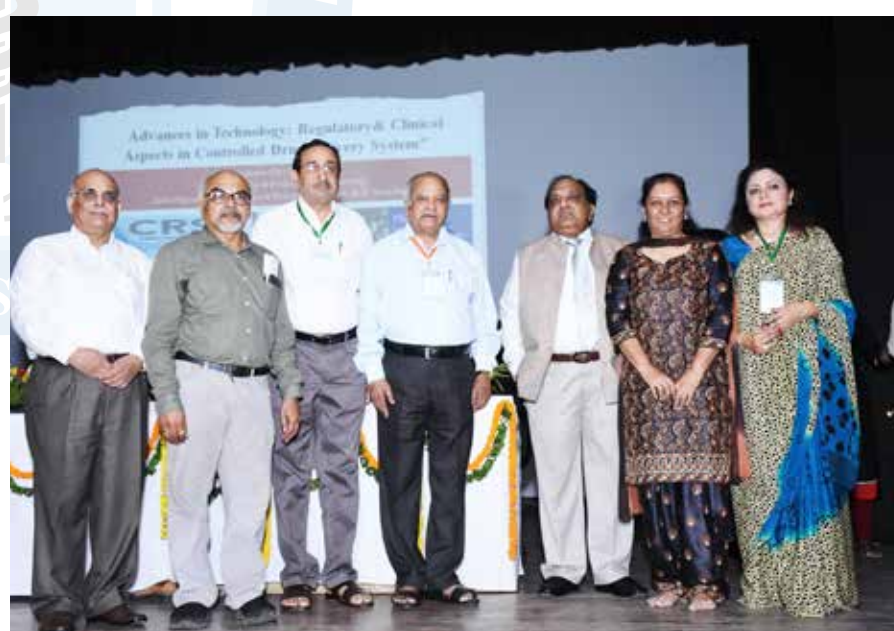
National Seminar on Advances in Technology, Regulatory and Clinical Aspects in Controlled Drug Delivery Systems organized on 15 th July, 2016.