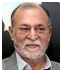
Hon. Shri Anil Baijal Chancellor