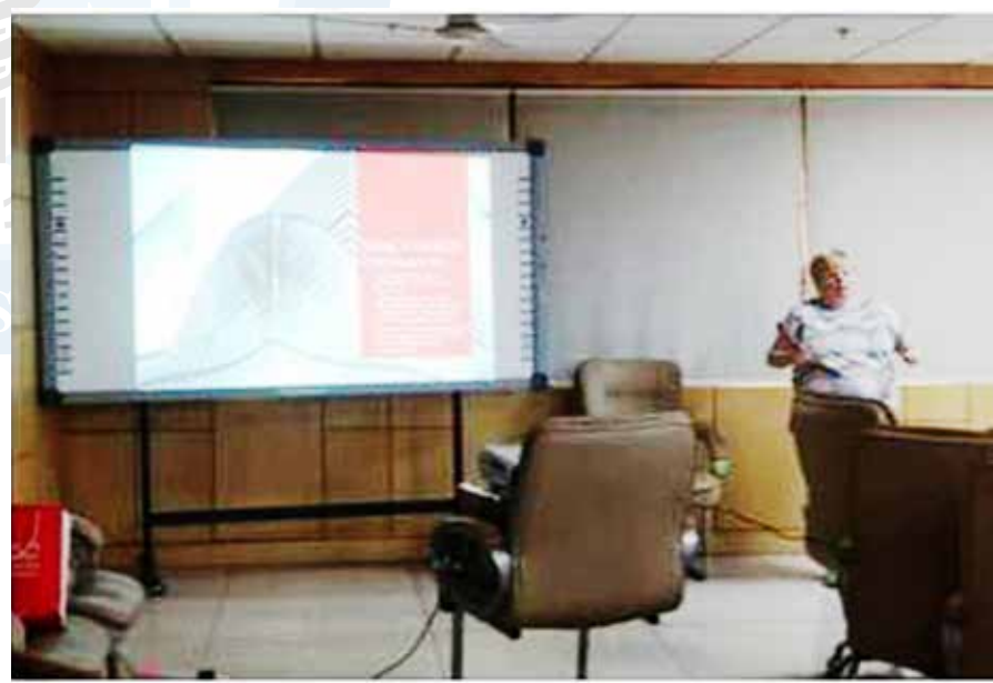
Guest lecture on the topic "entitled Immunity to Mycobacterium tuberculosis" on 16 th November, 2016.