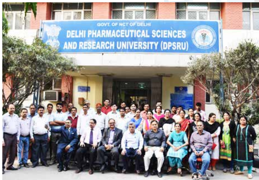
Teaching and non-teaching staff of Delhi Institute of Pharmaceutical Sciences and Research, New Delhi.