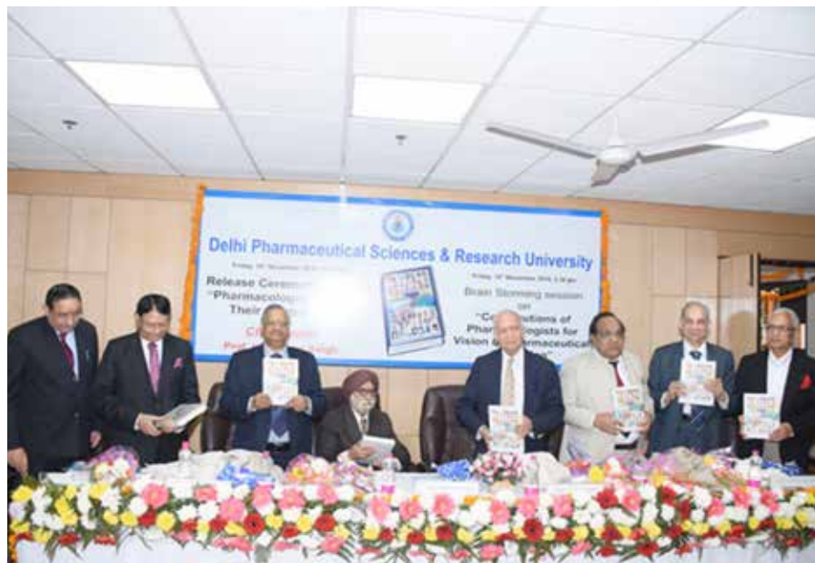
Book release cum Brainstorming Session on Contributors of Pharmacologists for vision of Pharmaceutical Education organized on 18 th November, 2016