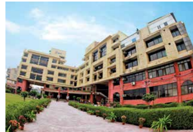
Jagannath Institute of Management Sciences, Rohini, Delhi