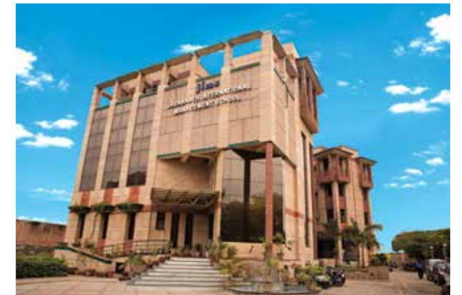
Jagannath International Management School, Kalkaji, Delhi