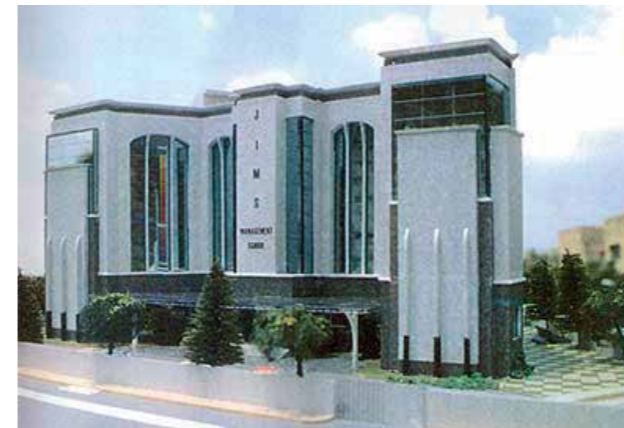
Jagannath International Management School, Vasant Kunj, Delhi