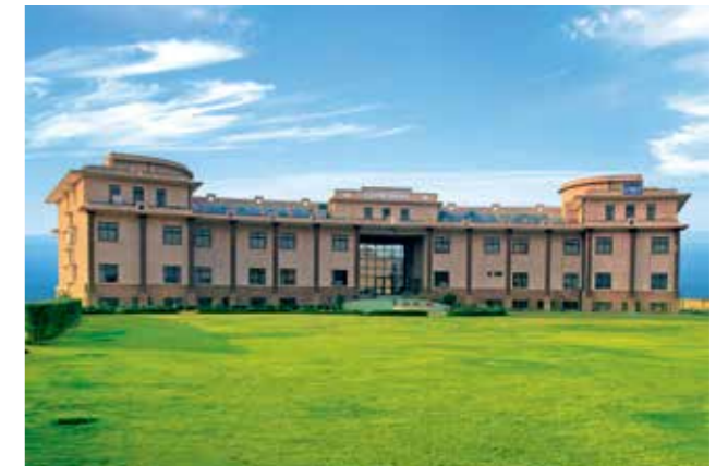
Jagannath Gupta Institute of Engineering & Technology, Jaipur