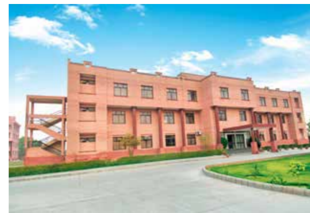
Jagan Institute of Management Studies, Jaipur