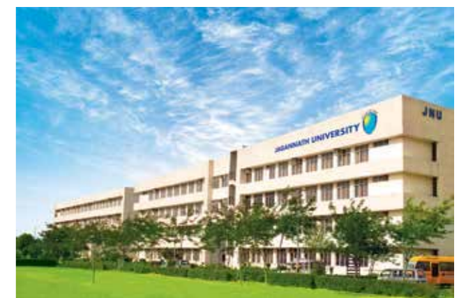
Jagannath University, Bahadurgarh, Haryana