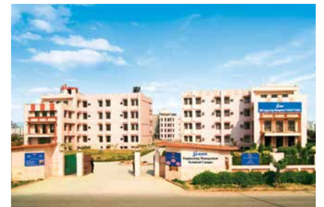
JIMS Engineering Management Technical Campus, Greater Noida