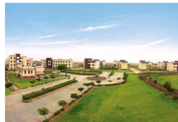
Jagannath University, Jaipur