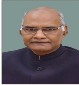
Hon'ble President of India Shri Ram Nath Kovind