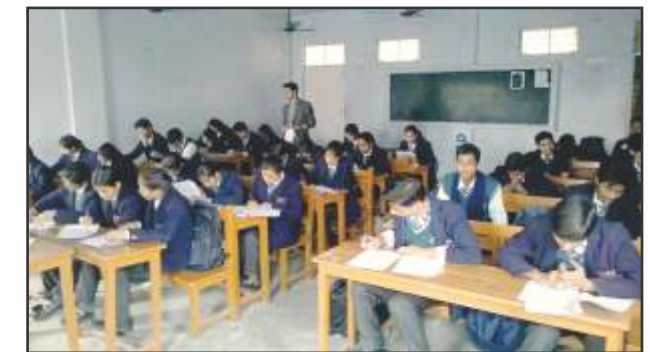
Student giving TSST exam organized by MPGI