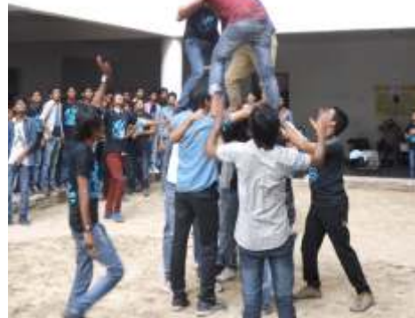
Students participating in the game of 'Dahi Handi'