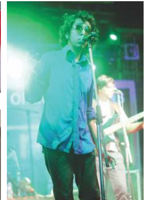
First time Rock Band performance in Kanpur by 'Astiva' (MTV Fame)