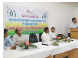
Inauguration of Entrepreneurship Development Cell at MIPS