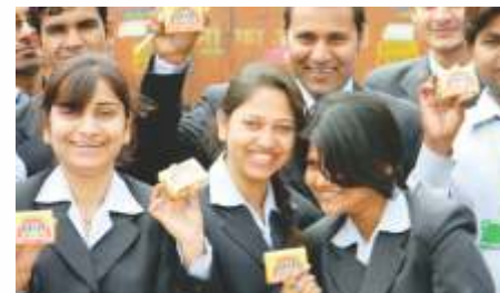
Students on Industrial Visit to Ghari Soap Factory (Rohit Surfactant Pvt. Ltd.)

The value based education is delivered by the most competent and dedicated staff .The highly qualified teachers work with zeal and commitment to promote the educational , intellectual and emotional growth of the students