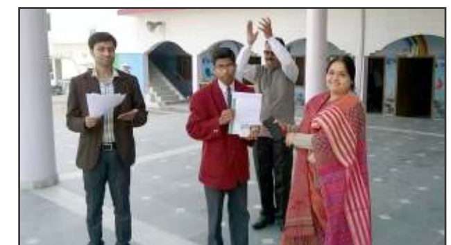
Students of Central Academy getting prize and certificate