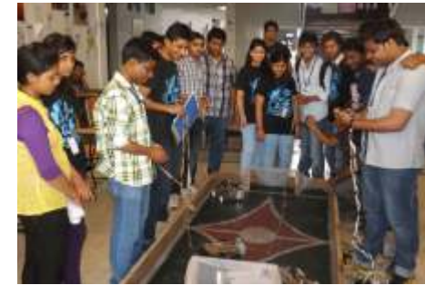
Students showing their Robot in 'RoboWar'

At MPGI, we are at the constant process of promoting our students to participate in various other activities like reading, technical training, computer surfing, project designing etc. We have separate clubs for faculty members and experts.