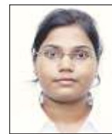
Shiwali Smartchip Ltd. 3.15 LPA