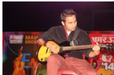
Guitar Performance by student