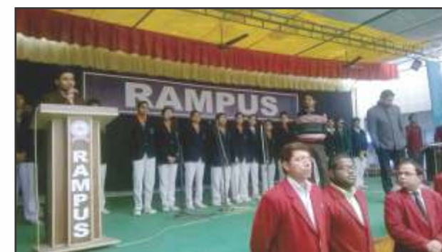
TSST Result announcement