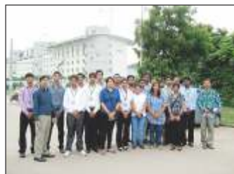
Students Industrial Tour to Infosys