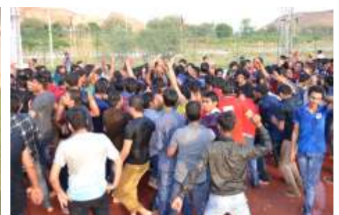
Rain Dance Party