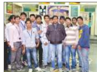
Students Industrial Tour to Parle-G