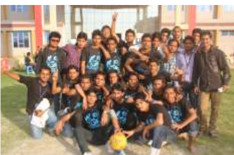
Student enjoying their win in football match