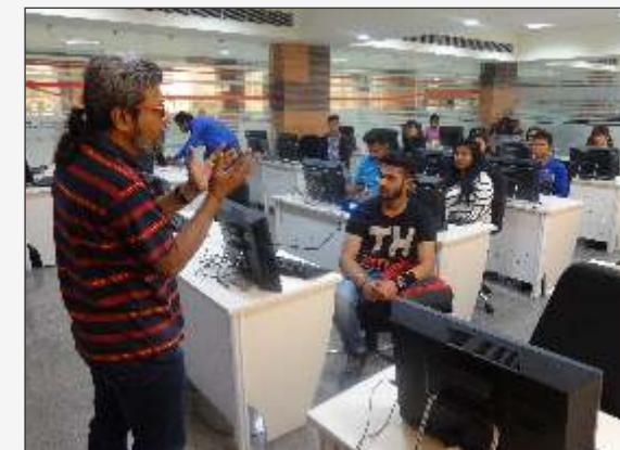
DESIGN & GRAPHICS WORKSHOP