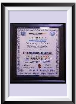
Excellence Award for Best Private University for Research & Promotion & Innovation by 3rd Intelligentia Summit & National Education 2017