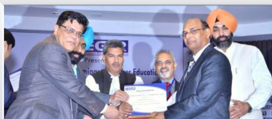
The School of Medical & Allied Sciences, K.R. Mangalam University has been awarded the Best Pharmacy College in India - 2016 by Centre for Education Growth & Research on 18 th March, 2016