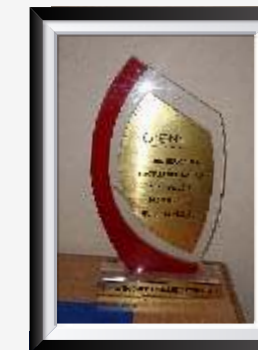
Econs Education Excellence Award 2014 by Econs Training Projects Consultancy