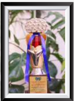
Gift of Gratitude by All India Council of Human Rights, Liberties & Social Justice 2017