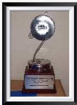
Top 10 Vice Chancellor Academics for 2014 awarded by Hitech Catalyzing Innovation & Collaboration 2014