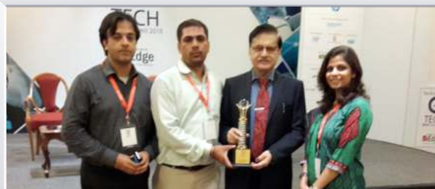
KRMU was awarded for its Outstanding Contribution in Building a Digital India at "The Economic Times E Tech India Summit 2015"