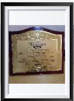
K.R. Mangalam University School of Journalism & Mass Communication First Best Emerging Media School 2015 by The Edutainment