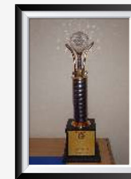
Outstanding Contribution in Building a Digital India in year 2015 by The Economic Times