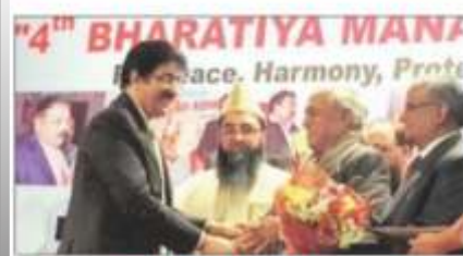
AWARD (KR MANGALAM UNIV.)

The 4th Bhartiya Manav Adhikar Samman -2014 for Peace, Harmony and Promoting Human Rights awarded KR Mangalam University the 'Asia's Best and Fastest Growing Private University' award.