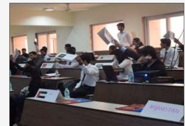
MODEL UNITED NATIONS 2015