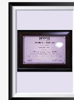
Best University for Industry Interface in India by CEGR 2017