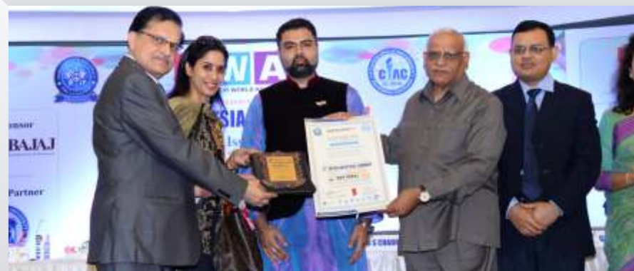
Excellence in Education Award by WCRC Leaders 2013