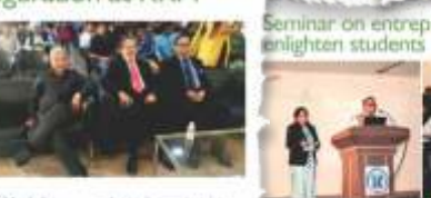
Seminar on entrepreneurship skills enlighten students