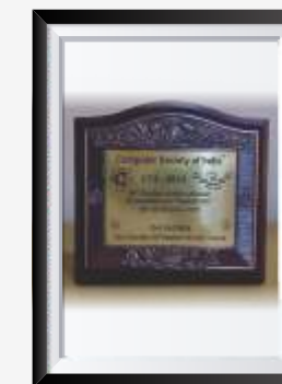
50th Golden Jubilee Annual Convention on "Digital Life by" Computer Society of India 2015