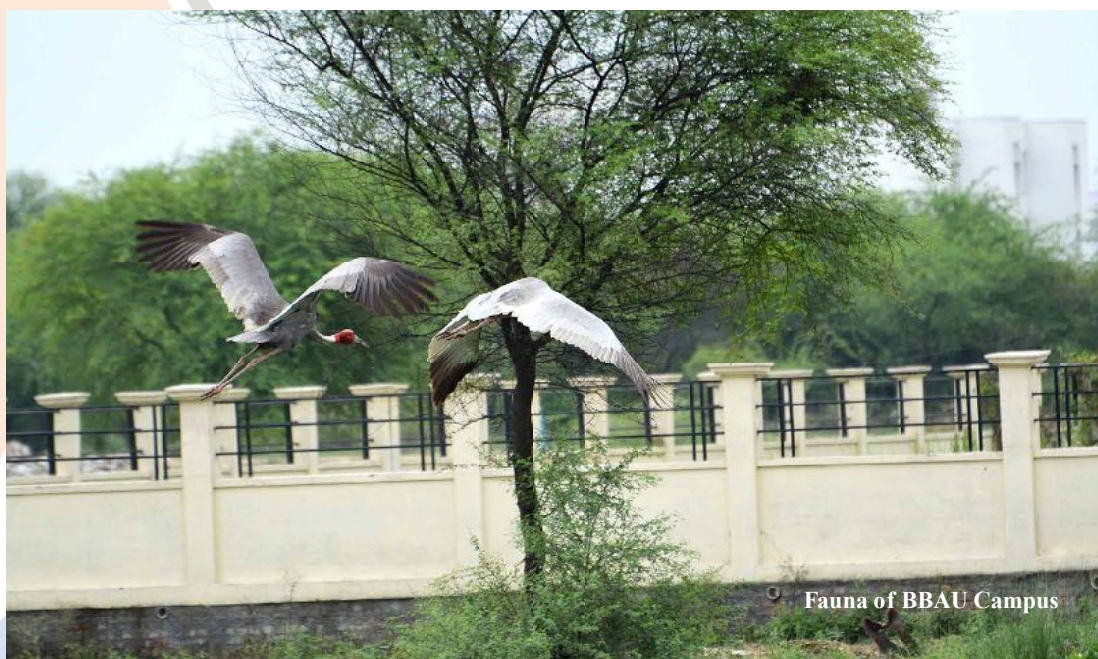
Fauna of BBAU Campus