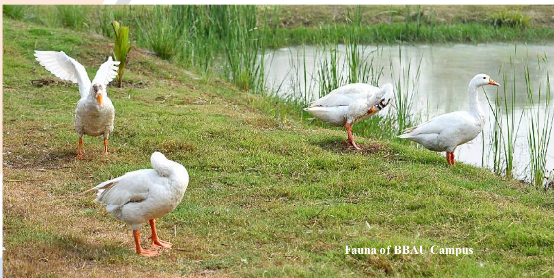
Fauna of BBAU Campus