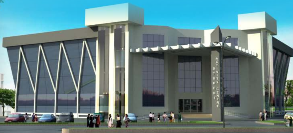
Student Activity Centre

Prospectus cost Rs. 600 for open Category Rs. 300 for SC/ST/PH Category