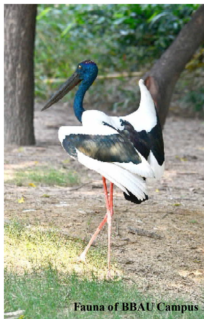
Fauna of BBAU Campus

The School for Bioscience and Biotechnology comprises the Department of Applied Animal Sciences, Applied Plant Sciences, Biotechnology and Pharmaceutical Sciences. All the departments offer both P.G. (M.Sc. and M. Pharm.) and Ph.D. courses. The two departments namely, Applied Animal Sciences & Applied Plant Sciences of School of Biosciences and Biotechnology commenced in the academic session 2001-02. The Department of Biotechnology started functioning from September 2005. The department of Pharmaceutical Sciences was established in 2010. All the departments are well equipped with laboratories and field facilities, as per requirement. The faculty members of the school belong to varied regions of the country with diverse fields of specialization. Since courses are multifaceted, SB & BT arms its students for good job opportunities as well as self-employment, thereby contributing to the economic growth of the country. This is self-evidenced from the course structure of the departments. The details of course offered at satellite campus of BBAU at IIT, Amethi are given below: