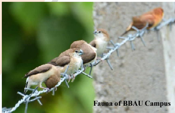
Fauna of BBAU Campus

Candidate applying for the Admissions in said programmes of BABASAHEB BHIMRAO AMBEDKAR UNIVERSITY (BBAU), LUCKNOW are required to apply through filled application form which may be downloaded from the official website of BBAU, Lucknow ( http://www.bbau.ac.in ) or may collect from the satellite campus of BBAU, located at IIIT, Amethi from 16 th June 2016. Application will not be accepted by any other mode. BBAU, Lucknow will send important information with regards to your application and examination through E-mail/Mobile number only. If candidate desires to apply for more than one course then, separate filled application form is required. Candidates are hence requested to fill all the details in the application form with the utmost care as no correspondence regarding change of details will be entertained at later stage. In case the candidate requires any changes, then they will be required to send a request email to admissionamethibbau@gmail.com .