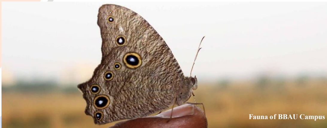
Fauna of BBAU Campus

* Other fees are as per University norms