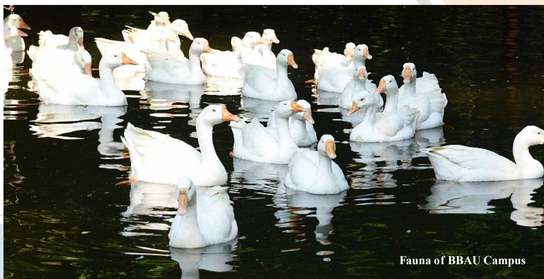
Fauna of BBAU Campus