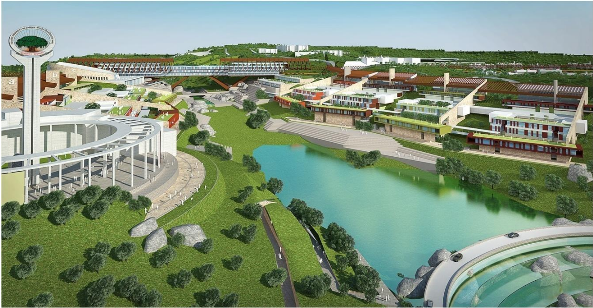
Back inner page Photo